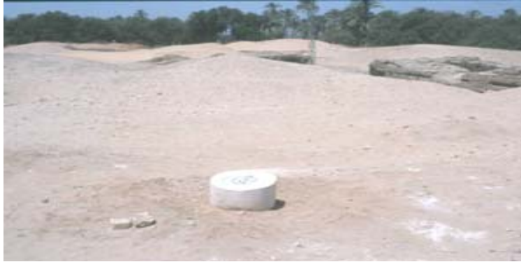
At marker 14

A reference marker. Follow the direction of the arrow towards the mass of brickwork close to the modern electricity pylon.