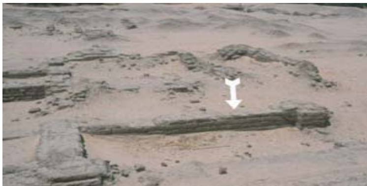
The remains of the King's House showing the location of the wall painting of the royal family discovered by Flinders Petrie

Turn and look to the left (west). Below lie the walls of the King's House which seems to be a small and private palace for Akhenaten. The rooms immediately across from the marker seem to be personal rooms for members of the royal family. In 1892, on the wall of one of them, the archaeologist W. Flinders Petrie found part of a wall painting which showed Akhenaten and Nefertiti relaxing, with their daughters seated at their feet. Petrie removed a part which showed two of the daughters. This is now in the Ashmolean Museum, Oxford. The arrow marks the original place of the painting, which was on the far side of the wall.