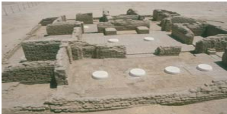
House Q44.1 after clearance with the long antechamber with reconstructed column bases in the foreground

In front of the staircase leading to the top of the modern viewing platform in front of a large private house which has the registration number Q44.1. The name of the owner is not known. Climb the staircase to the top of the viewing platform.