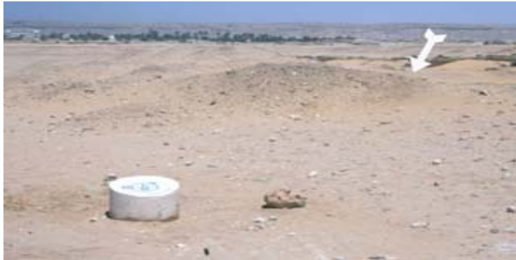
At marker 10

The marker has two arrows. The unnumbered arrow points to the building where the Amarna Letters were found. It lies in a slight depression on the far side of the nearest spoil heap.