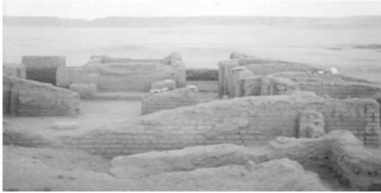
House Q44.1, a view to the east into the interior of the house. Against the rear wall of the central room is a well preserved low brick bench provided (unusually) with thick end walls. EES neg. 23/24.