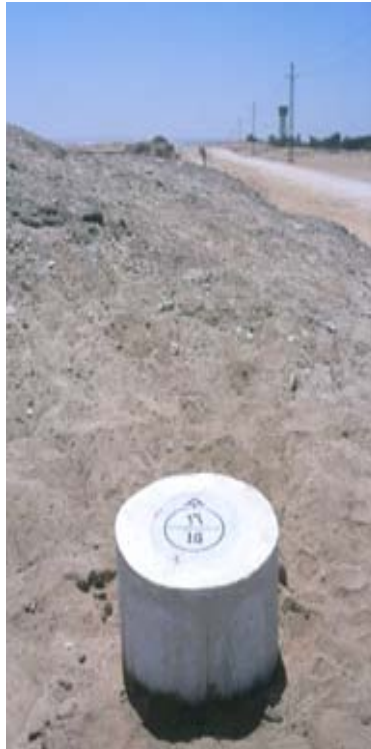
At marker 16

Marker no. 16 is the last of the series and points back towards start of the route. Before leaving turn and examine the end face of the ramp and the brick pier beside the road which supported the bridge. Notice how the wooden beams have become even more closely set, appearing in every alternate course of bricks. They had to help the brickwork bear the weight of the bridge, which must have been supported on heavy massive timbers.