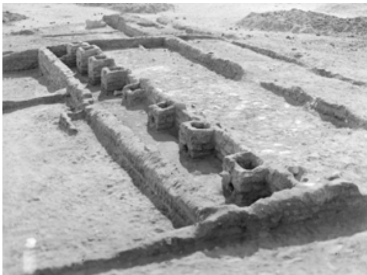
House Q44.1 at the end of the 1923 excavation. The view, towards the south-west, is of the cattle shed. The rough stone floor and brick mangers were well preserved. EES neg. 23/31.