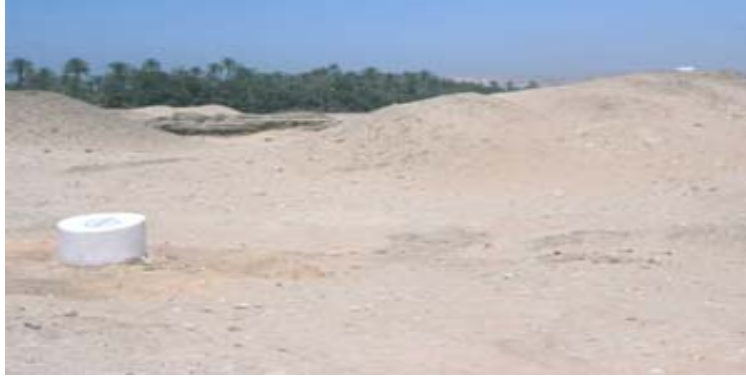
At marker 11

The marker points northwards. Turn right to follow the arrow and climb to the top of the long embankment of spoil from the 1931 excavations of John Pendlebury which runs northwards through the middle of the enclosure of the King's House.