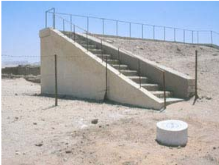
At marker 9

In front of the staircase leading to the top of the modern viewing platform in front of a large private house which has the registration number Q44.1. The name of the owner is not known. Climb the staircase to the top of the viewing platform.