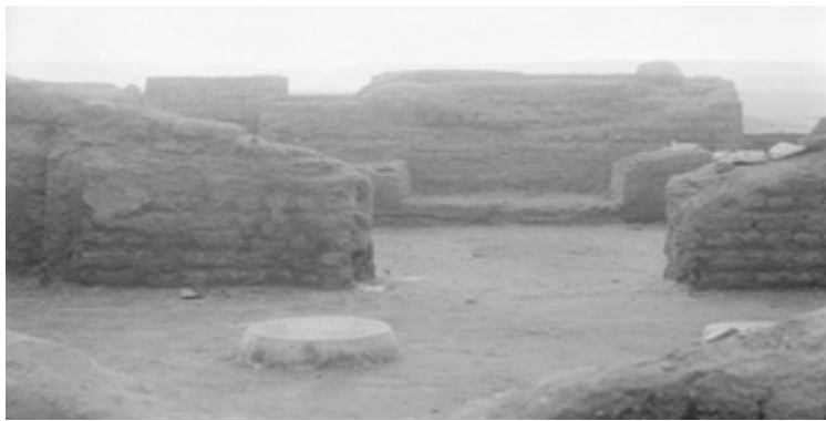
House Q44.1, a closer view to the east into the interior of the house. Against the rear wall of the central room is a well preserved low brick bench provided (unusually) with thick end walls. EES neg. 23/25.