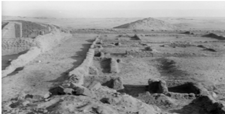
House Q44.1 at the end of the 1923 excavation, viewed to the north. The east wall of the house is on the left. In front are the walls of kitchens and perhaps servants' houses. EES neg. 23/20.