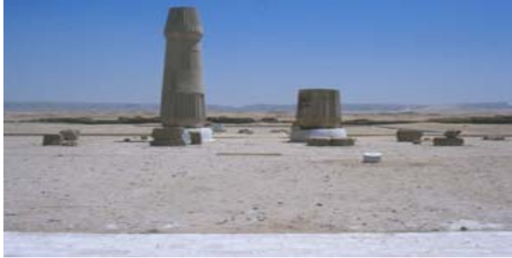
Between markers 4 & 5

In front of the Sanctuary of the Small Aten Temple.