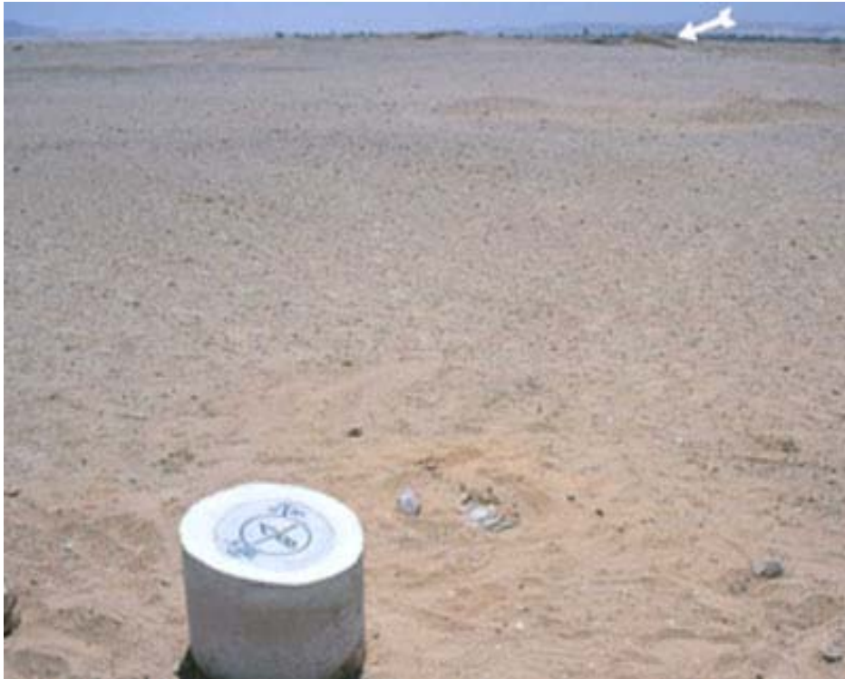
At marker 8

A reference marker which offers two directions, towards markers nos. 9 and 10. First follow the arrow to no. 9, a longer walk towards the conspicuous modern viewing platform which has a triangular profile.