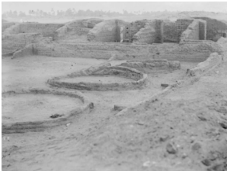
House Q44.1 at the end of the 1923 excavation, viewed towards the north-west. The south wall of the house is in the background. In front are the lowest courses of brickwork belonging to the circular grain silos.