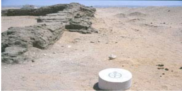
At marker 7

Just outside the doorway in the south enclosure wall. Turn left and follow the arrow, walking along the outside of the Small Aten Temple enclosure wall, to marker number 8. As you walk beside the wall note the thick buttresses at regular intervals.