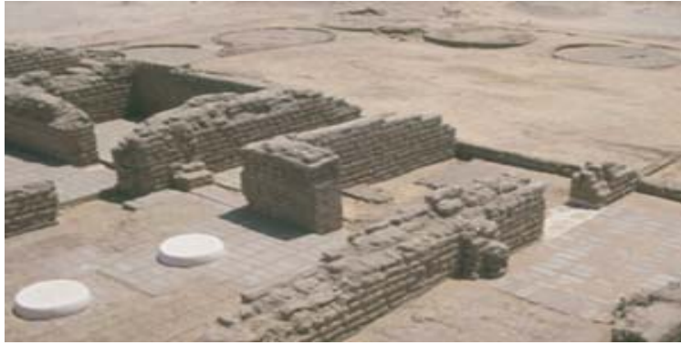
View through house Q44.1 with the granary court in the background