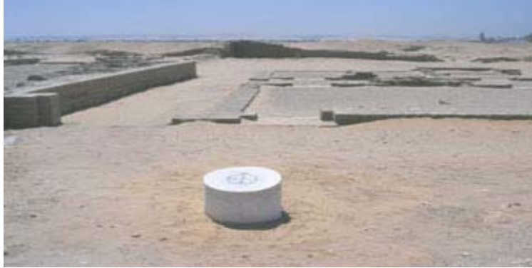
At marker 4

In front of the third pair of pylons lies a small brick building, called in modern times the 'Priest's House'. The arrow points towards it.