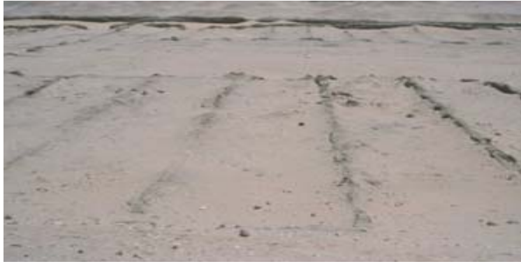
Parallel lines of mud-brick walls: the royal storerooms

From marker no. 12 continue northwards along the embankment and descend to marker no. 13.