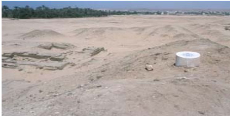
At marker 12

The marker is on top of the embankment, half way along.