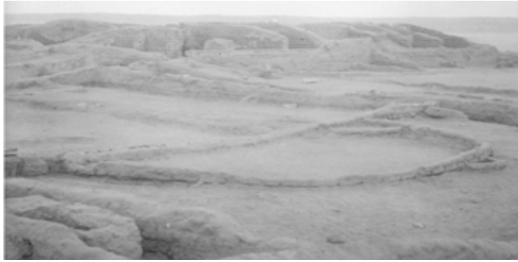
House Q44.1 at the end of the 1923 excavation, viewed towards the north-east. The south-west corner of the house, with the entrance lobby, is in the background. In front are low walls belonging to courts adjacent to the cattle shed and which might also have served for the keeping of animals. EES neg. 23/23.