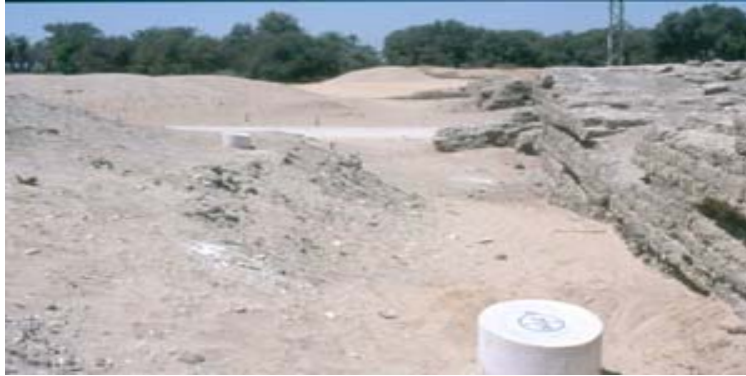
At marker 15

Beside the thick side wall of a ramp which led up to a massive bridge which crossed the line of Royal Road and so joined the King's House to the Great Palace on the far side. The ramp consists of two parallel walls which retained a fill of sand and gravel. This was removed during the 1931 excavation. The ramp is 9 metres wide. As you walk beside the wall notice the deep horizontal grooves in the face of the brickwork. These mark the places where beams of wood were laid in the brickwork in order to bind it together and reduce the likelihood of cracking.