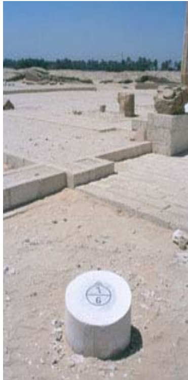
At marker 6

On the axis of the temple, slightly beyond the foundations of the fourth pylon which, unlike the others, had been built of limestone blocks. The doorway between the pylons had probably contained a doorframe made of large sandstone blocks. Part of one of these has been set on top of modern limestone blocks on the south side of the doorway. It bears the top of a cartouche of the Aten carved on a gigantic scale. On the opposite (northern) side of the doorway is a sandstone block from the lintel or from a cornice connected with the columns. It originally bore the cartouche of Nefertiti but this has been chiseled out in readiness for the carving of a replacement name. The recarving was never done.