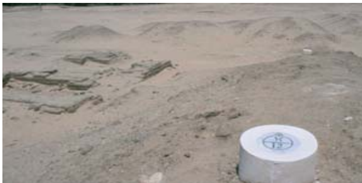
At marker 12 with marker 13 in the top right of the image

From marker no. 12 continue northwards along the embankment and descend to marker no. 13.