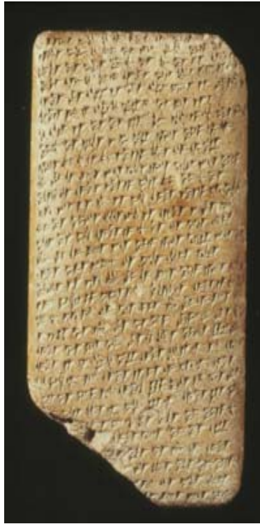
Example of a cuneiform tablet

The tablets were inscribed with the cuneiform script, used to write the Akkadian language of ancient Iraq. When translated the tablets were found to be diplomatic letters from the reigns of Amenhetep III and Akhenaten. Mostly they had been sent to Egypt from the courts of the kingdoms of Mitanni, Babylonia, Assyria and Cyprus, and from Egypt's vassal states in Palestine and Syria. Most of the letters are now divided amongst the Egyptian Museum (Cairo), the Berlin Museum and the British Museum (London). The letters provide a unique view of the realities of Egypt's empire at this time.