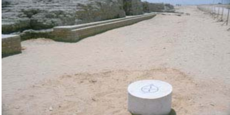
At marker 1

At the front of the Small Aten Temple, in front of the northern brick tower of the outer pylon and within the barbed-wire fence which protects the front of the temple from passing traffic. The modern road follows the line of Amarna's principal thoroughfare, Royal Road (so-called in modern times).