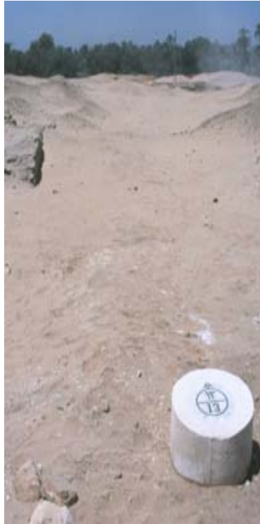
At marker 13

A reference marker. Turn left (west) and follow the direction of the arrow towards the distant electricity pylon. The route passes along the north side of the King's House.