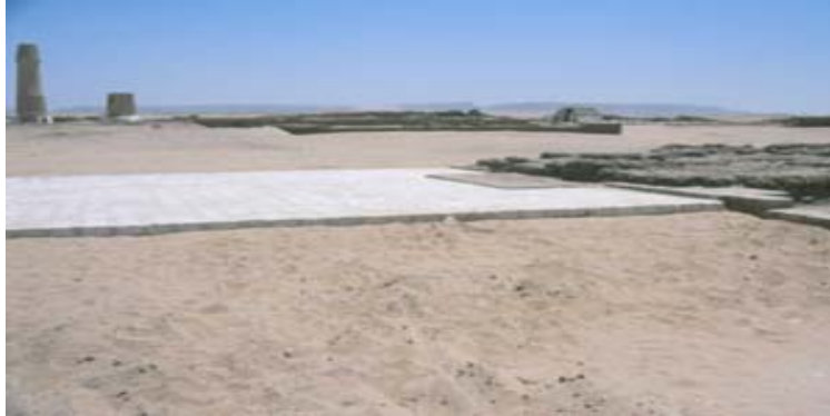
Between marker 3 and 4

Walk around the altar and towards and across the limestone pavement between the towers of the second pylon and continue towards the limestone pavement between the towers of the third pylon.