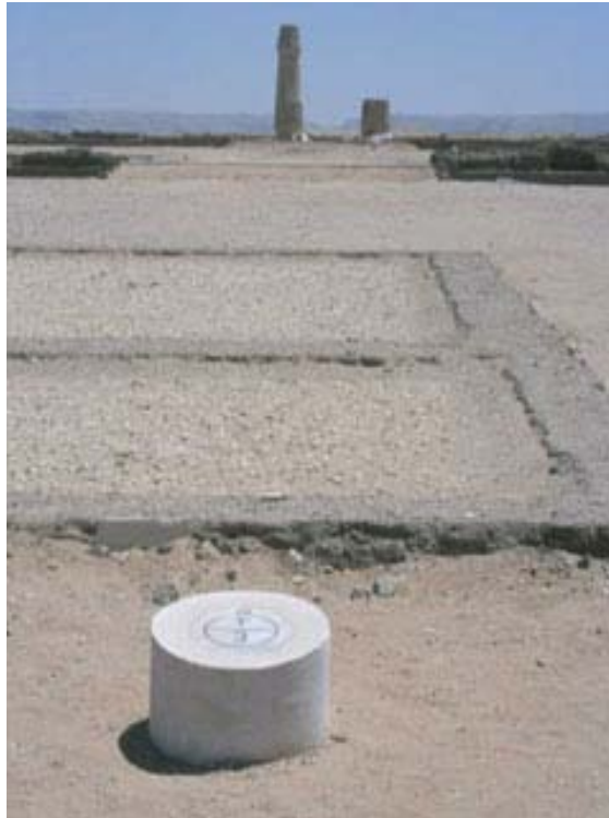
At marker 3

Beside the outline of a large platform or altar of mud bricks.