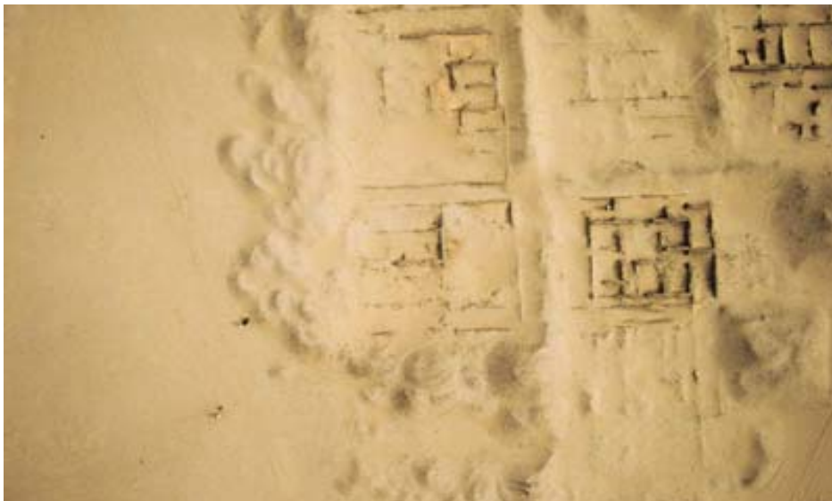
Aerial photograph of the 'Bureau of Correspondence of Pharaoh', the poorly preserved building in the very centre of the image surrounded by undulating spoil heaps along its western, southern and eastern faces (north corresponds, approximately, to the top of the image)

The walls of this modest and now very ruined building included bricks stamped with the words 'Bureau of Correspondence of Pharaoh'. It was here, in a pit in the floor, that local villagers discovered a deposit of clay tablets around the year 1888.