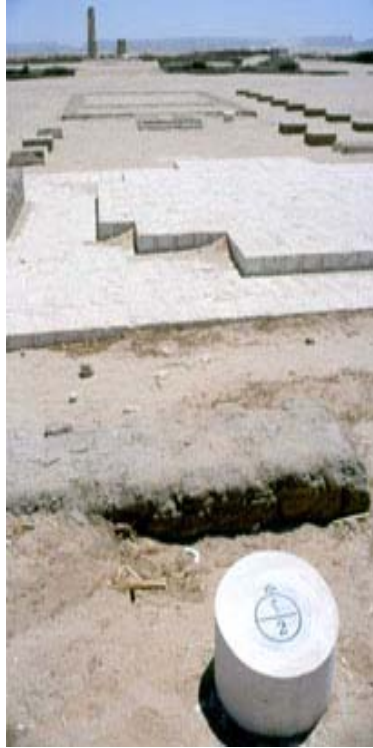
At marker 2

In front of the main entrance to the temple. The arrow points along the main axis of the temple.