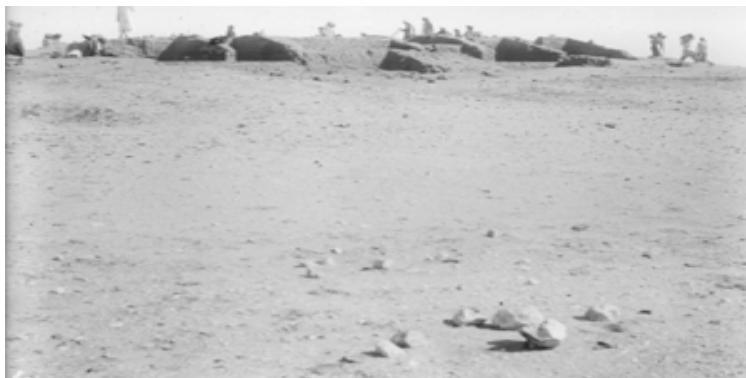
General view towards the north-east of the excavation of Q44.1 in progress. Only the walls of the house have been exposed. The courtyard containing the granaries lies in front, not yet excavated. The walls of the house were thicker and had therefore been preserved to a greater height. EES neg. 23/17.

In the middle distance to the east, the closer and larger of the ruined houses belonged to the High Priest Panehsy, the owner also of rock tomb no. 6 of the North Tombs.