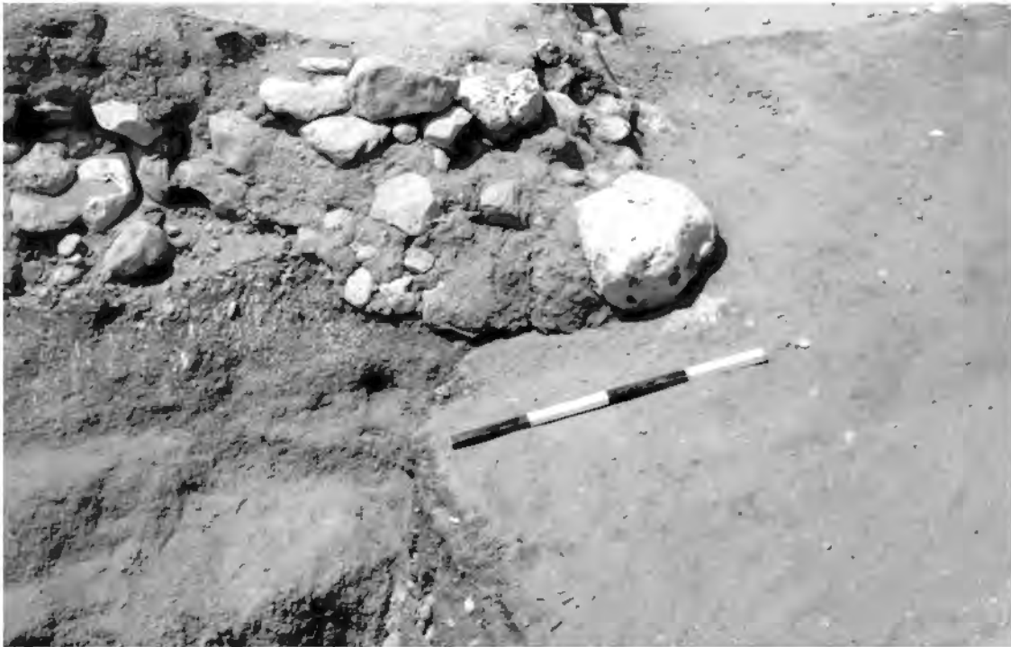
Figure 6.2. North-east corner of the brick-paved courtyard in square M11, looking west. The corner masonry rests on top of midden debris (Phase III = M10[75]) filling the quarry.

In that report it was stated that the paved courtyard belonged to Phase IV, and thus post-dated the deposition of the lower midden layer within the quarry (Phase III). The reasons were twofold: a mortar line running along the foot of the enclosure wall on the quarry face equivalent to the top of the lower midden layer (labelled "marl mortar" in Figure 6.3, and cf. Kemp 1983: Plate 1.1); a thin deposit of organic material on the north side of the courtyard which appeared to run beneath the foundations of the courtyard and was assumed to be equivalent to the lower midden layer within the quarry (this is just visible in section 84 of Kemp 1983: 7, Fig. 2). In completing the excavation of the north-east corner in M11 this interpretation was amply confirmed (Figure 6.2).