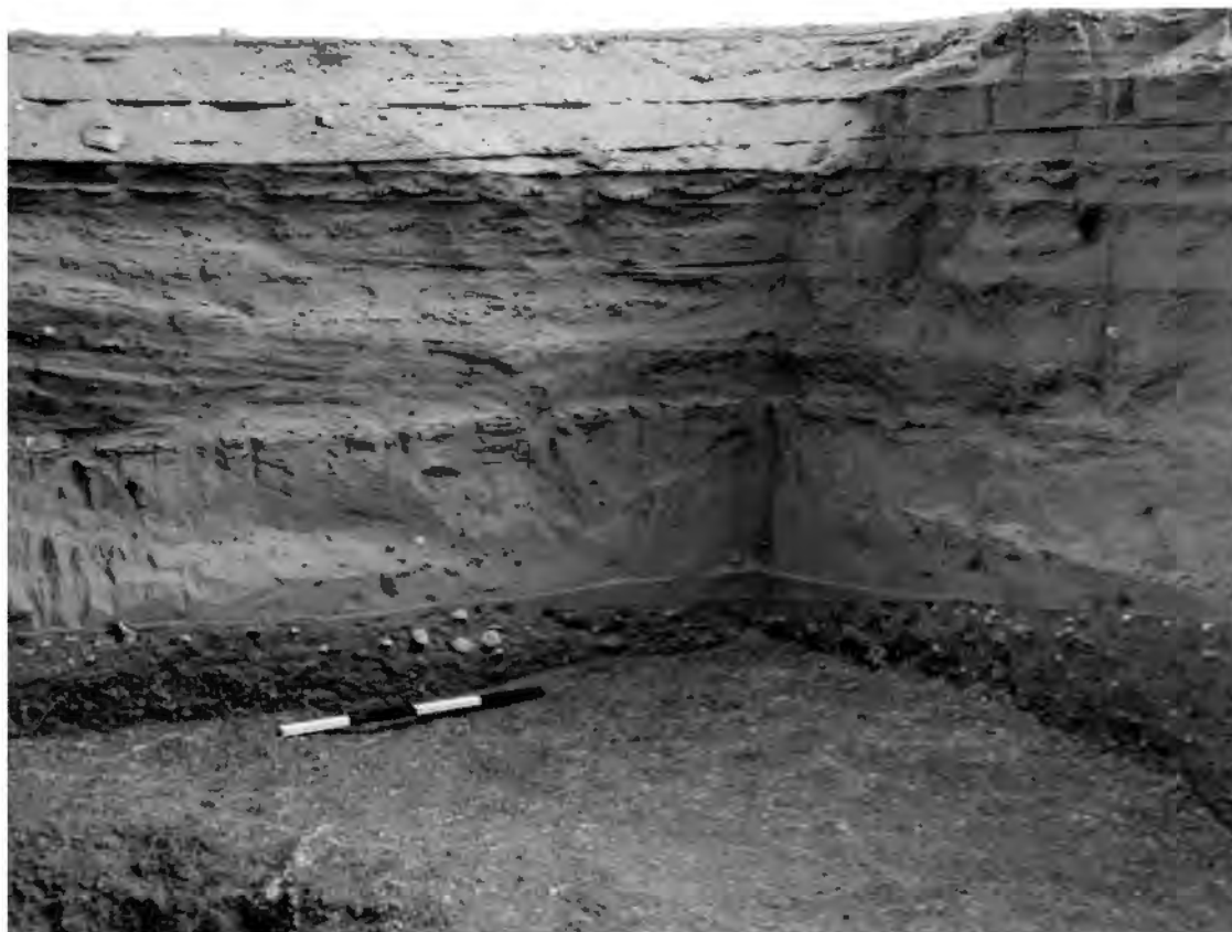
Figure 6.1. Stratigraphy in square N9, looking south-east.

Square N9, with no structures present, displays a clear and uninterrupted stratigraphic sequence (Figure 6.1), consisting essentially of five members (Kemp 1983: 7, Figure 2): an initial quarry fill of earth and debris of various kinds (Phase II), a lower midden layer of organically-rich soil (Phase III), a bed of clean, wind-blown sand suggestive of a period of abandonment (Phase VI), an upper midden layer characterised by steeply dipping beds of chaff (Phase VII), and finally layers of sand and silt which had accumulated since ancient times (Phase IX). The various members which originate from the village area grow thinner towards the south, to the extent that the lower midden layer (Phase III) more or less peters out across square N9.