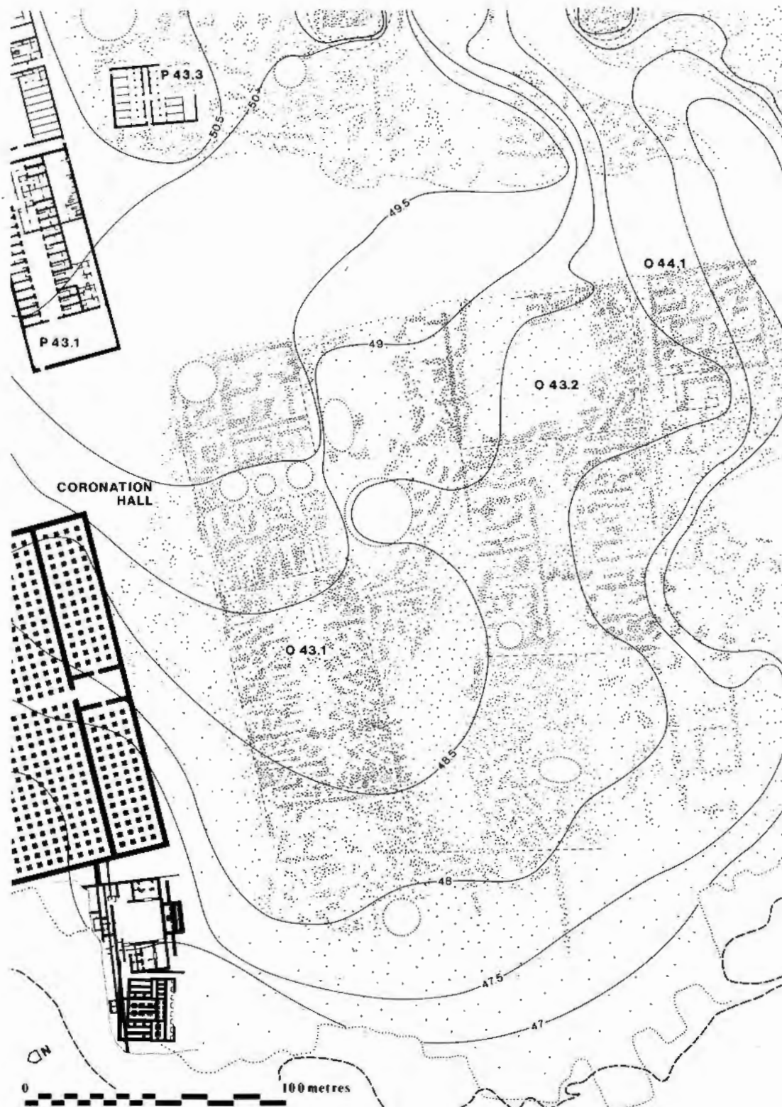
Figure 5.1. Sample area of Survey Sheet no. 6.