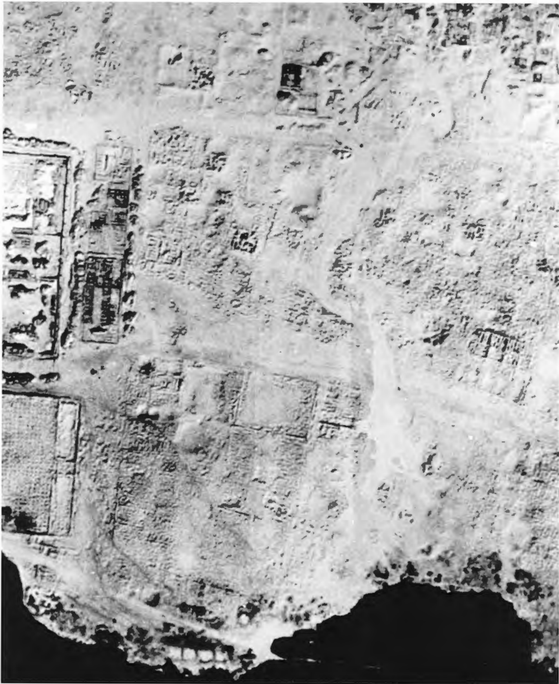
Figure 5.2. Part of an aerial photograph including the area of Figure 5.1, taken in 1932.

Petrie's plan to justify taking the possibility of identification seriously. A scale plan was therefore made of such traces as can now be identified. The resemblance to Petrie's plan is so close as to remove any lingering doubts as to their identity. Although in Petrie's report it appears as if it is a separate building, its context implies that it is just one part of a larger administrative complex. No external wall connections are marked simply because the inner