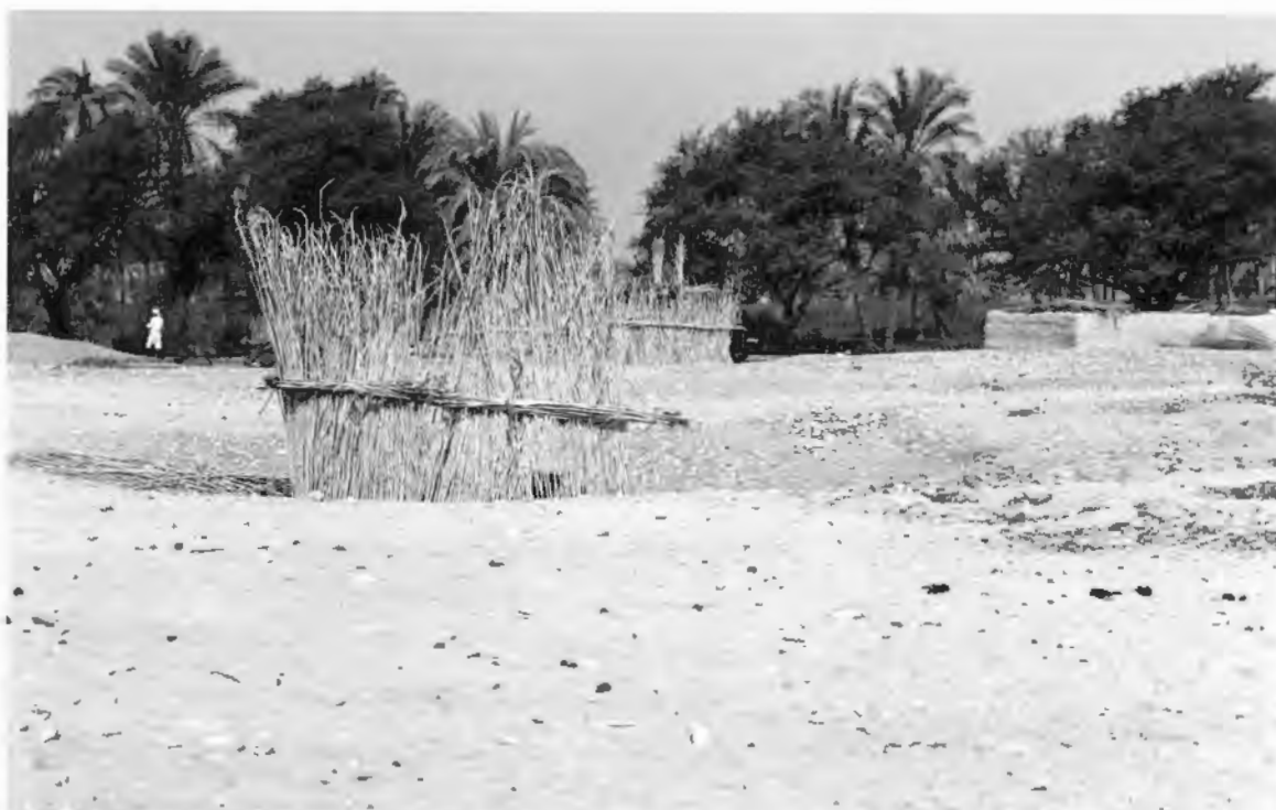
Figure 5.4. Well-depression west of O43.2 now occupied by a temporary farmer's shelter.

with moored boats, cattle pens and an open grain depot, and beyond these two buildings depicted in great detail, one evidently a huge magazine block with central pavilion, the other a complex of rooms and gardens with a well-depression and ornamental pools.