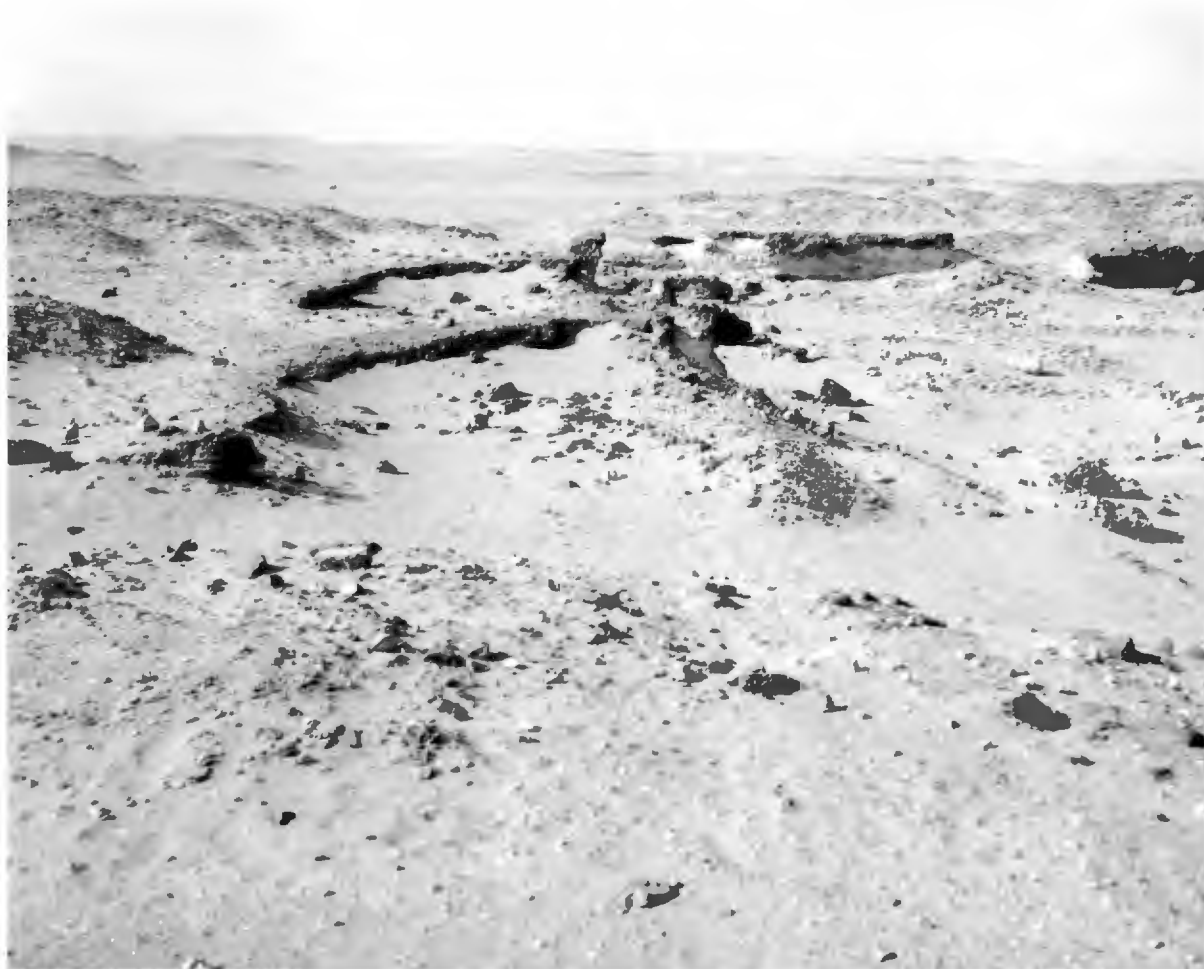
Figure 8.3. Remains of the embankment along the rear of the Sanctuary, looking south.

For information on details the positive value of these scenes is absolute, but as general portrayals they can become something of a hindrance, for when examined carefully it is all too evident that they are impressionistic rather than pictorially reliable. Quite apart from mutual inconsistencies, in the case of those showing an Aten temple individual features occur which the excavated evidence shows were to be found sometimes in the Great Aten Temple and sometimes in the smaller Hat-Aten temple. This statement contradicts the approach of the COA III team, which regarded all but one of the ancient scenes as showing the former only. 3 But this seems to have been a blind-spot, for quite specific identifications of some features from the tomb scenes can be made with excavated evidence from the Hat-Aten. These are: one or more pylons with multiple flag-poles, a large square platform reached by a ramp in the outer part of the temple, and a small isolated building containing a Window of Appearance. 4