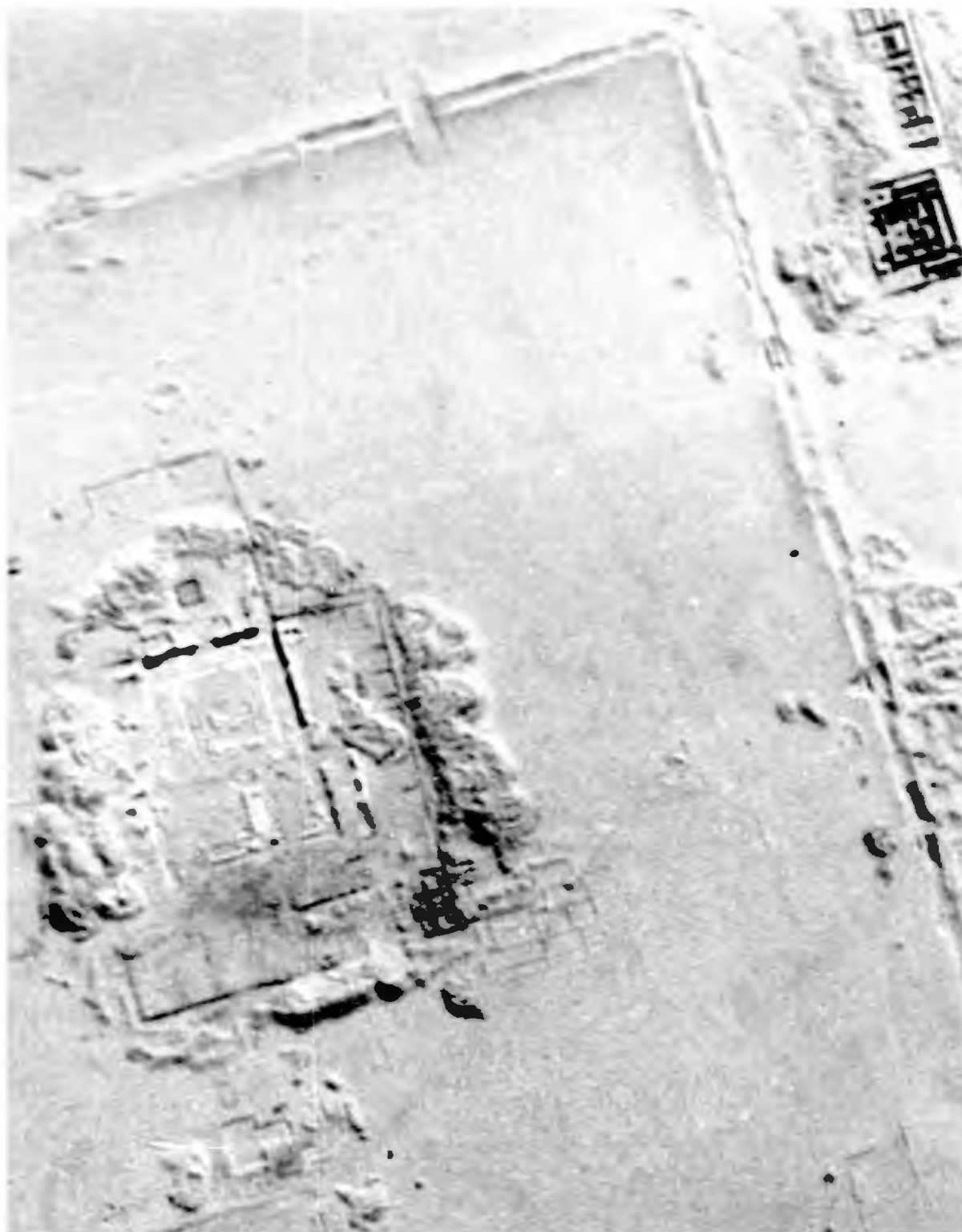
Figure 8.6. Aerial photograph of the Sanctuary of the Great Aten Temple taken in 1935 after the completion of Pendlebury's excavations in 1934.