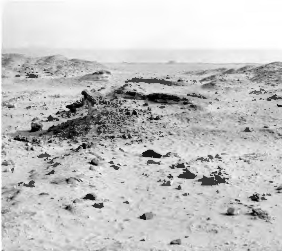
Figure 8.2. Remains of the embankment along the rear of the Sanctuary, looking north.

The preserved height of the embankment shows that it must have been part of the final building phase. This is implied equally by the coincidence of the embankment with the foundation trenches for the stone walls of the Sanctuary. The effect must have been to make the Sanctuary appear as if standing on a mound with inclined sides. The height of this apparent mound above the surrounding mud pavement would have been about one metre.