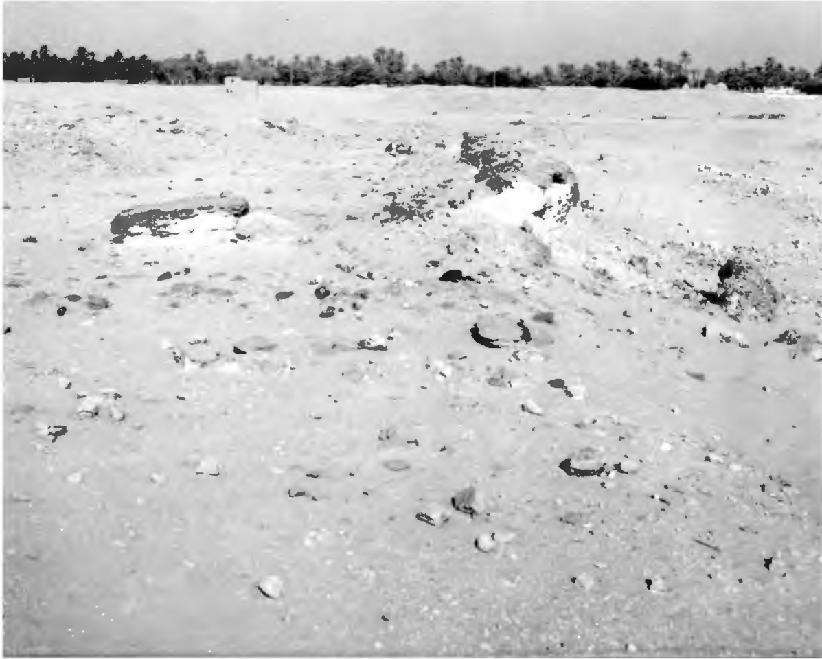
Figure 8.4. Remains of the embankment along the south side of the Sanctuary, looking west.

only honest course is to make a tentative reconstruction limited to those parts where the evidence is fairly straightforward. This would, however, produce very sketchy results indeed since, as will be argued shortly, Lavers recorded even less of the original building than he thought. If it is understood that a reconstruction is only a visual counterpart to a written hypothesis, the discipline of trying to wrest from the excavated data and from the tomb pictures a fairly complete reconstruction drawing can have some value. For the results are of more than architectural interest. They effect the way that we visualise Akhenaten's cult of the Aten, and thus, because of the stress that contemporaries placed on it, the way that Akhenaten wished his role to be perceived publicly.