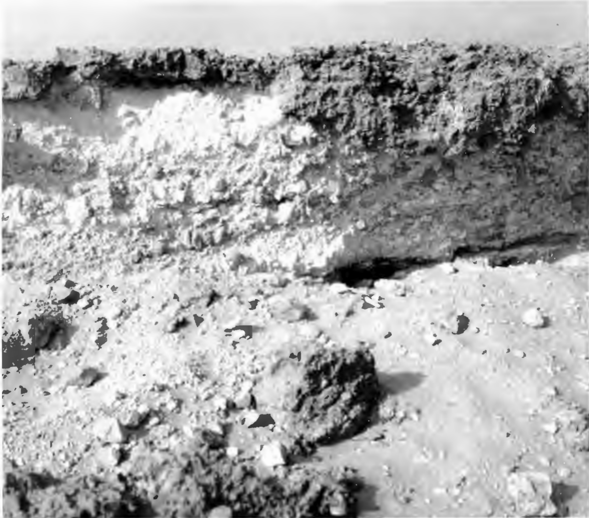
Figure 8.5. Detail of the embankment on the south side, showing the darkened weathering crust that has formed on the top of the gypsum concrete, and the horizontal division lower down between the base of the concrete and the top of the natural desert.

2850]. Although now mixed and diluted with much sand, the volume seems to be far in excess of such a fill for walls which were not particularly thick. In view of the sloping bank of the same material that runs around the outside of the Sanctuary, it is preferable to see this rubble as the remains of an equivalent filling inside the building, which not only replaced the loose surface sand and gravel that the builders first removed before laying their foundations on a hard desert surface, but also raised the floor of the Sanctuary up at least as high as the top of the surrounding embankment. Thus the whole building was constructed on a low elevated platform made by filling up the spaces between foundations of walls and offering-tables with gypsum concrete (or partially so, for some excavation photographs suggest that the lowest material in the fill was loose sandy rubble). We can gain an idea of the result from one place in the Great Aten Temple where portions of concrete platform have survived: in the front part (the Per-Hai) of the so-called Gem-Aten building, where three rectangular blocks of concrete separated by the trenches of robbed walls are still a conspicuous feature. Parallel remains can be found on the site of the Great Palace. When in ancient times the stonework was removed much damage must have been done to this platform, particularly since each of the many stone offering-tables seems to have had its own independent stone foundation descending to hard desert.