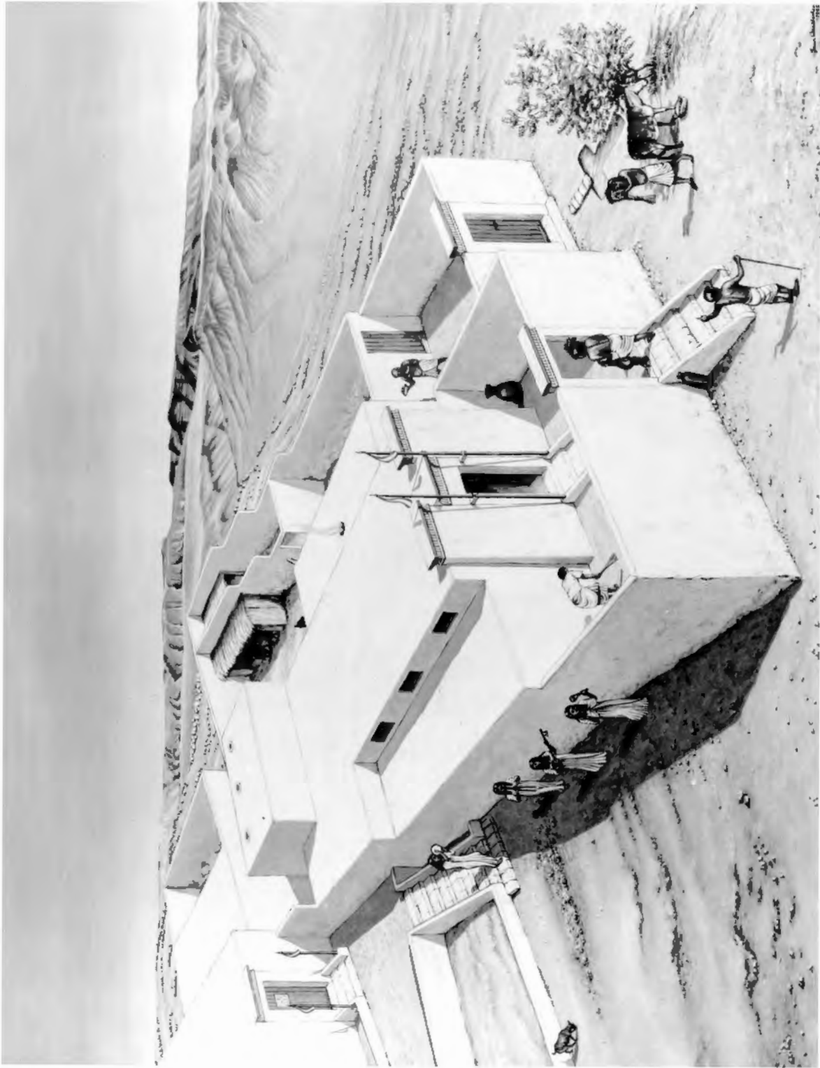
Figure 0.1. Reconstruction of the Main Chapel (by Fran Weatherhead).