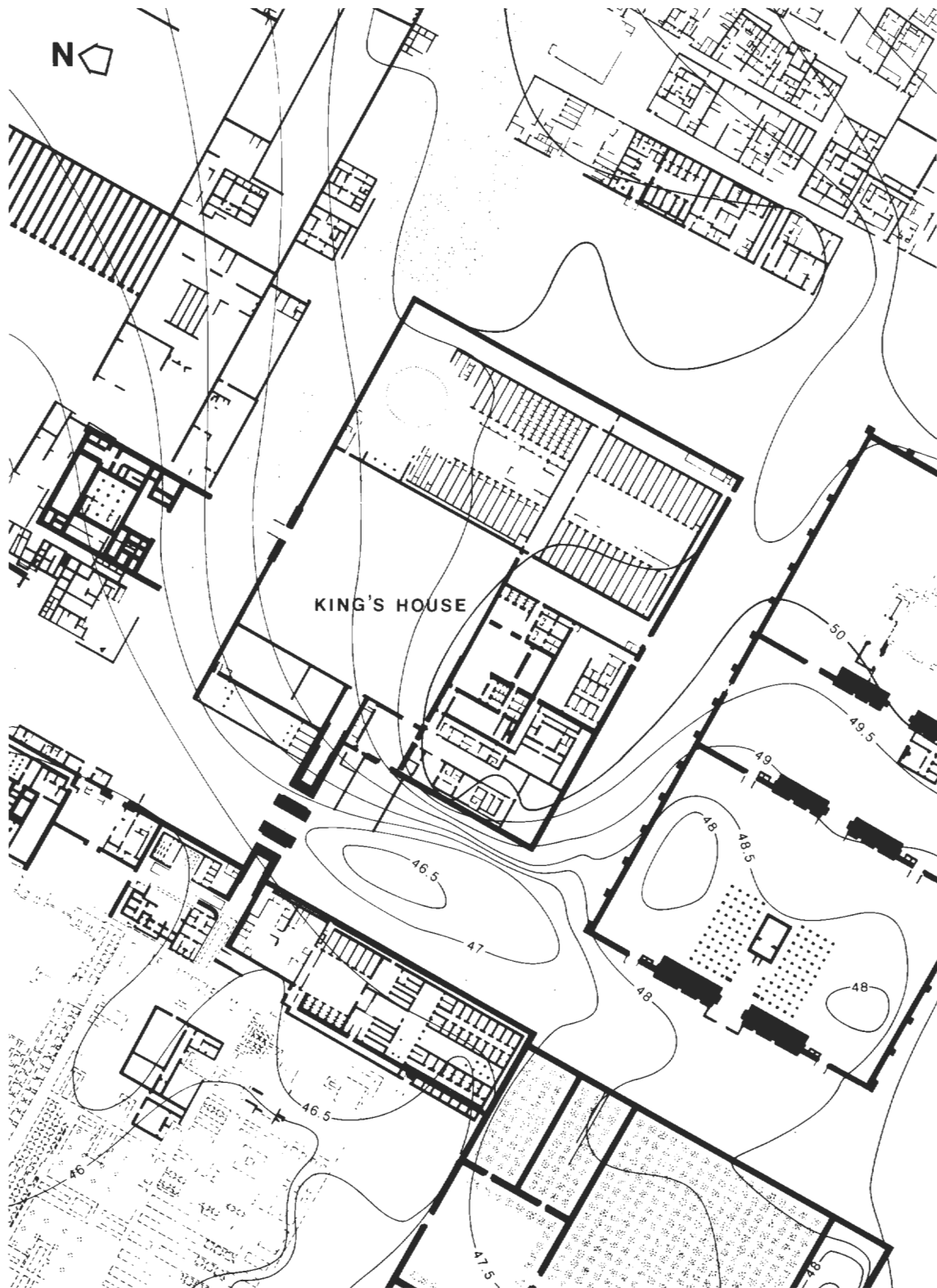
Figure 6.1. Sample area of Survey Sheet no. 5, which covers the Central City. The King's House is in the centre. The scale is 1:2000.