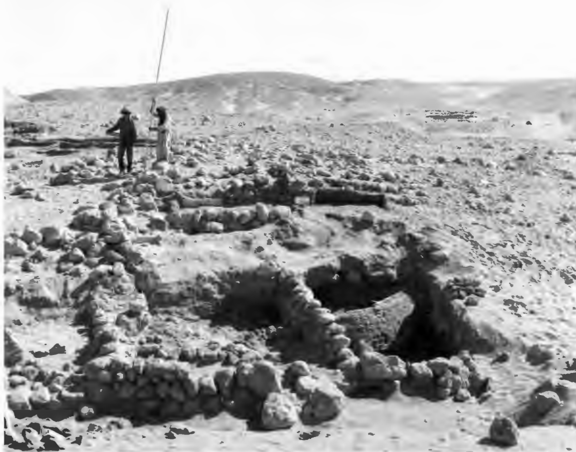
Figure 3.1. View of squares R10 and S10 at an early stage in excavation, looking east.